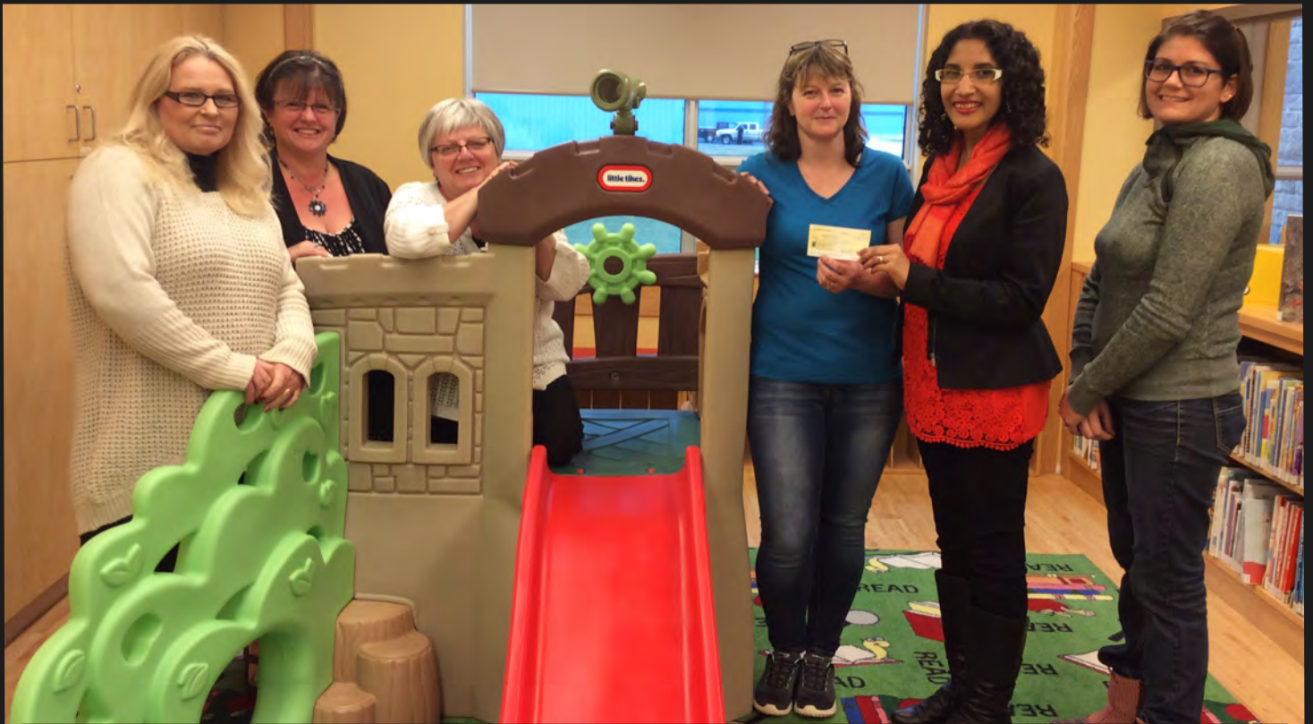
Beta Sigma Theta generously donated a new play structure this year